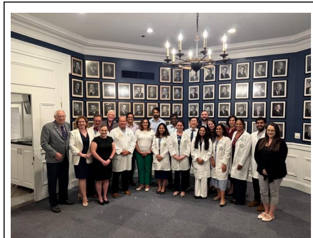
USF Allergy-Immunology Faculty