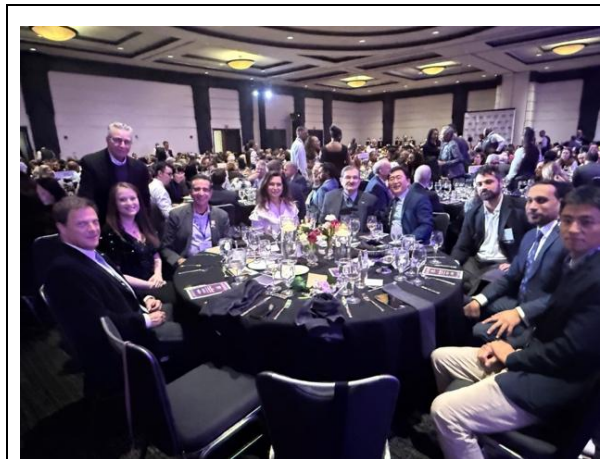
AAAAI 2026 Foundation Dinner